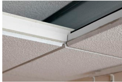
↑ The 2resist ceiling panels are supplied with a finishing layer (fine grain structure).

This means the system can be flexibly reused in the transformation of buildings or changed layouts. Think for instance of the renovation or conversion of student accommodation. Talk about sustainability!